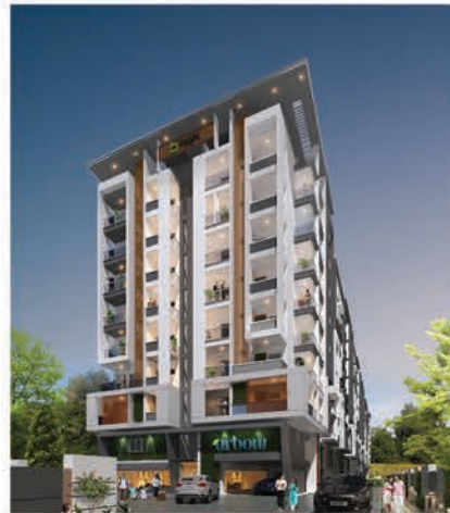
Arbour, Tellapur 2021 - Completed, 182 Units