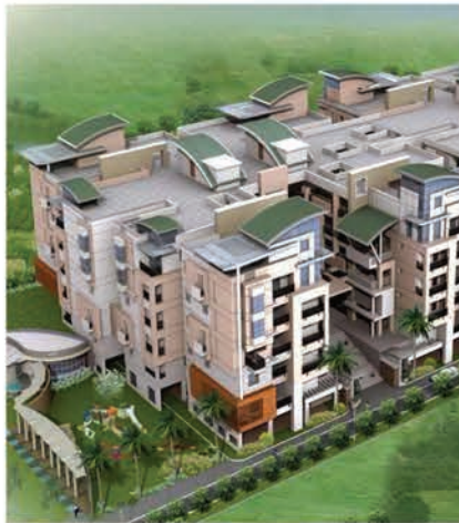
Bonsai Homes, Tellapur 2015 - Completed, 215 Units