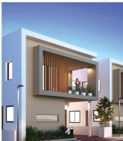
Bhuvi Villas, Siddipet 2022 - Completed, 71 Units