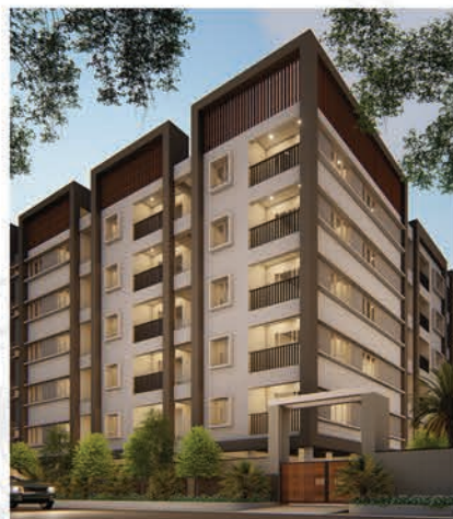
Dev Dar, Siddipet 2022 - Completed, 50 Units